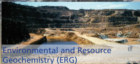
Environmental and Resource Geochemistry (ERG)