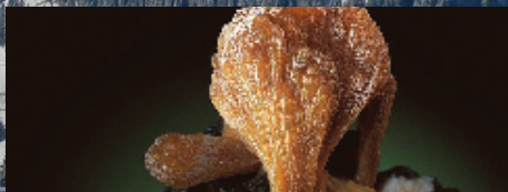
Earth Materials (EM)