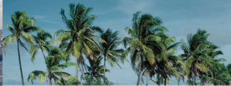
Earth and Life Evolution (ELE)