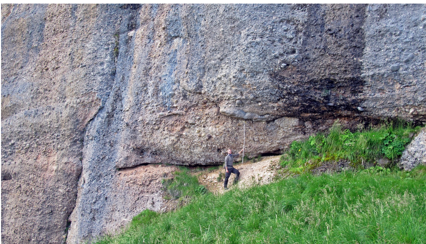
The investigated rocks beneath the summit of Mount Rigi. Pebbles as large as footballs imply that the Alpine rivers had the character of a torrent. The rocks at Mount Rigi thus document the occurrence of a large delta that formed at the border of the Alps 25 million years ago.