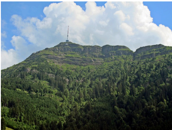
Mount Rigi, picture taken from the front. The number of lithified river deposits increase towards the top of the mountain range. The pebble sizes increase from the base to the top of Mount Rigi. The river, which deposited these rocks, adapted a chaotic flow pattern through time.